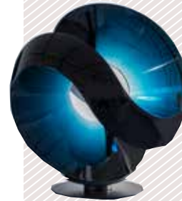
Aqua One This 66cm diameter crystal sculpture typifies artist Vlastimil Beránek's work: a simple yet perfect shape in expressive colours that looks different from every angle.