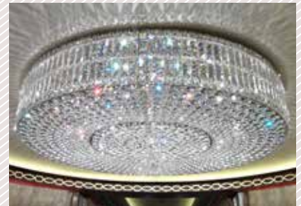
Crystal Caviar tile Made from hundreds of Bohemian crystal pearls, this tile looks like caviar made from crystal and inspired the company's name.